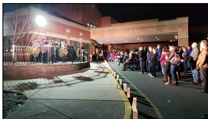
Hundreds of people gathered at the 2018 "Light the World."