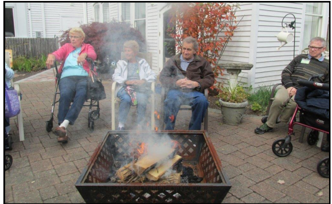
Above: Outside on a autumn afternoon, Adult Day Center members warm themselves by the fire. Next up: s'mores!