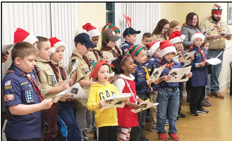
Cub Scouts and family members serenade residents during the holidays.

Her hobbies include baking, sewing (needlepoint), reading, golf and watching the UConn girls play basketball.