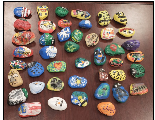
The painted rocks bring inspiration and smiles to those at Mulberry Gardens.