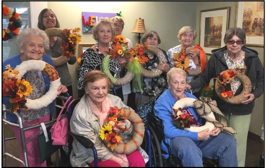
Above: Members of the Marian Heights Adult Day Center display the fall wreaths they crafted.