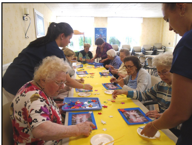
Left: Interns assist at crafting Fourth of July decorations.