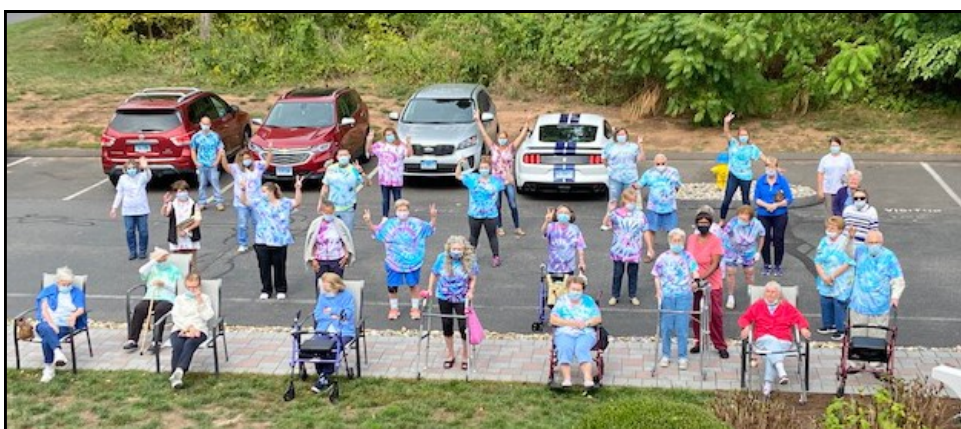
Staff and residents gather to show off their shirts for Mulberry Gardens' annual Tie-dye Day held during National Assisted Living Week in September.

Since early spring when the pandemic impacted not only the world but Connecticut, Hartford HealthCare assisted living and skilled nursing communities continually modified their delivery of care to ensure the health and safety of residents and staff. As the state cautiously reopened, Mulberry Gardens consistently operated under guidelines set by the state of Connecticut and the Department of Public Health.